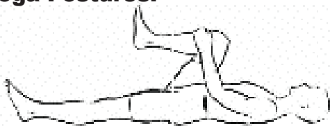
1) Knee Hug