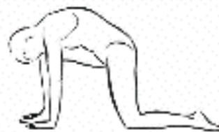
7) Bent Knee Lunge