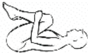
4) Little Boat