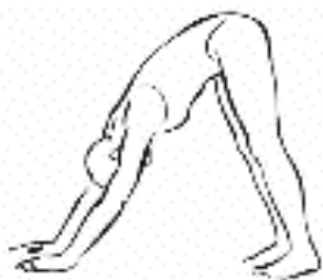
6) Downward Facing Dog