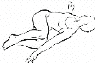
2) Simple Floor Twist