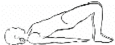
3) Half Bridge